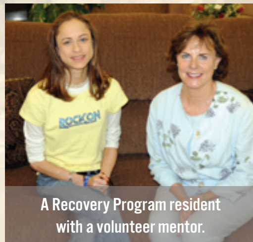
A Recovery Program resident with a volunteer mentor.

Join us for a Lunch and Learn . You'll enjoy delicious food in our dining hall, hear about our ministry, then tour our campus. Call for details.