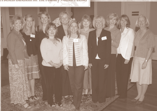
More than 220 attendees at last year's Hearts of Hope Luncheon raised nearly $90,000 to help furnish new dorms and open the doors of our new Women's Center!