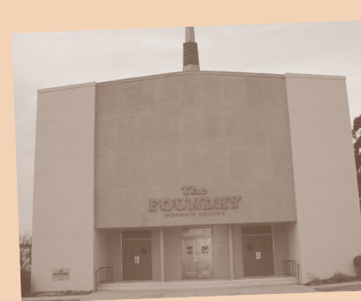
The former First Baptist Church of Bessemer now houses The Foundry Worship Center and will provide shelter for up to 50 female residents in our recovery program in 2008.