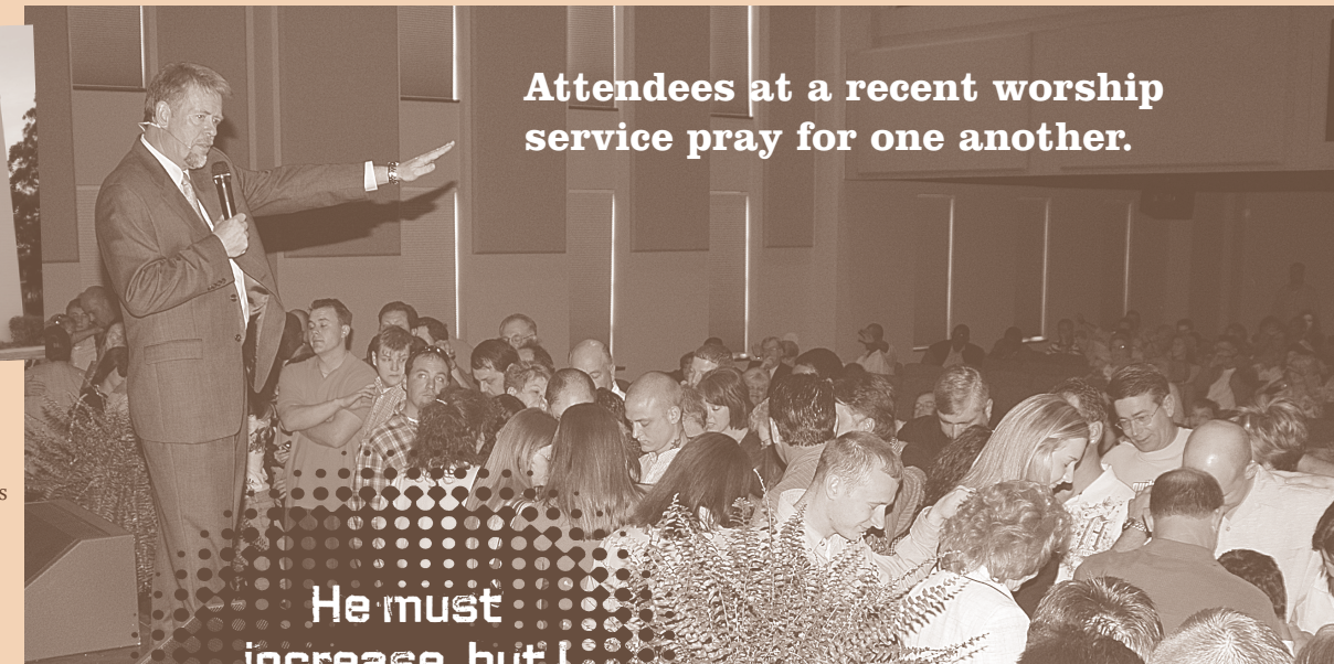
Attendees at a recent worship service pray for one another.

He must increase, but I must decrease. —John 3:30