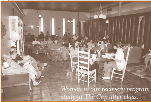
Women in our recovery program study at The Cup after class.