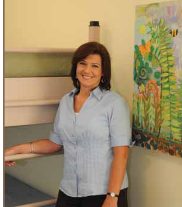
The Foundry residents appreciate the comfort of their newly decorated "home."

The Foundry is grateful to our creative friends who truly touched lives, as well as to the financial supporters who contributed funds to decorate the dorm at $5,000 per floor.